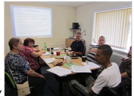
Brain Injury Awareness group

The next block of activities will include a different choice of projects, and if they continue to be so