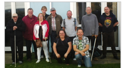
The Butlins Posse!

drink! We stayed in the 'Gold' chalets (yes, really), visited the local historic airfield and saw a Lancaster bomber in action, went to the seal sanctuary, adult comedy night (RUDE!) and lots of other stuff.