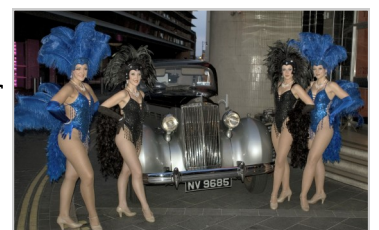
A warm welcome from R & R Productions

programme, just let us know and we can send one to you. We will have raised over £3,200 when all the money comes in which, whilst quite a modest sum, is not bad for a first attempt! Thanks so much to everyone who supported us, both beforehand and on the night, and thanks for all your lovely comments in the Visitor's Book.