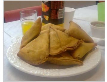
Mmmm .... samosas!

A big Thank You to everybody who provided the food.