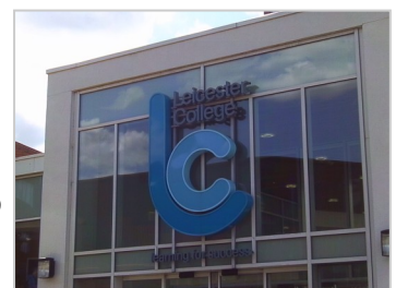
Freeman's Park campus, College entrance

Last year I had a choice of joining the Lunch Club, Digital