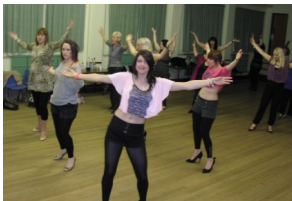
Burlesque dancing; one of the many fundraisers