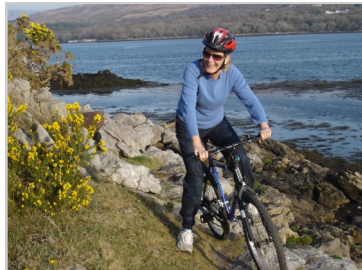
From Amstersdam to Eindhoven (via Ireland!)

"Friends in Holland are helping us to plan our trip - sorting out bike hire, planning routes, offering B & B and helping to